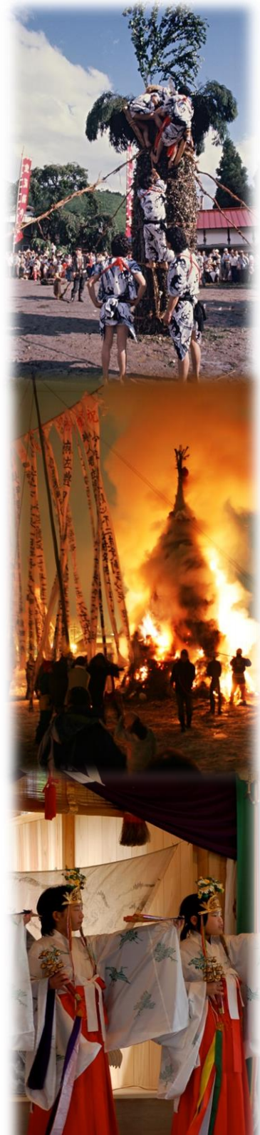
liyama Furusato Hali