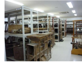
▲ Folk Artifacts Room Contains over 400 traditional tools

The second floor has an archive of ancient documents and a room with a collection and display of traditional tools and antiques